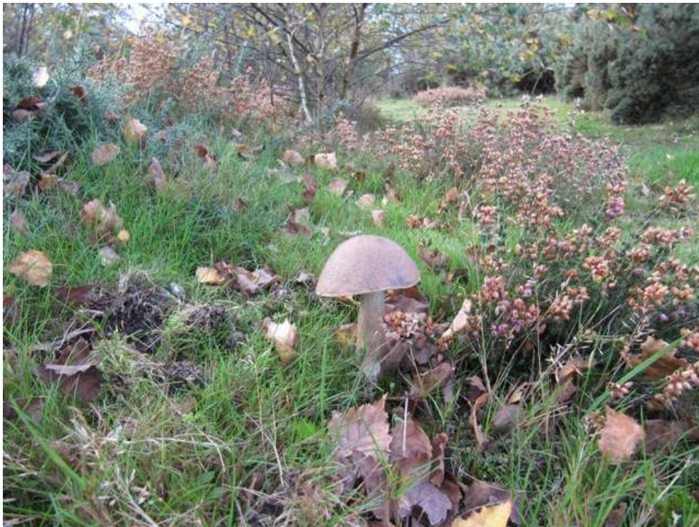
Leccinum scabrum - Brown Birch Bolete