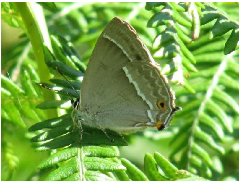
Purple Hairstreak Butterfly