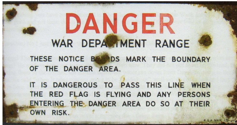
A wartime warning sign on the Common (Sign Loaned by Ronnie Strowger)

During World War II, the Common was used as a camp by the Army. Signs of their occupation can still be seen near The Pheantry and The Cleeves. There were no trees then on these areas, the rabbits kept all seedlings down. Concrete and brick bases for army huts and remains of boots can still be found. The sealed top of the well they dug is just visible beside the present-day tools container. They had a search light on the Noddle, observer posts, various target practice ranges, gun enclosures and trenches. Local children found a great many bullets and other artefacts to play with, sometimes with tragic consequences. Ammunition was stored at the edge of the northern boundary of the Common. The Officers were quartered in the Mill House, and all around the village.