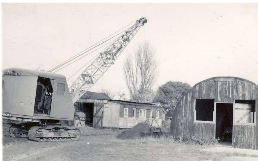
Nissen Hut, 1955, near Cleeves' Railway Carriage. Alf Fisk

During World War II, the Common was used as a camp by the Army. Signs of their occupation can still be seen near The Pheantry and The Cleeves. There were no trees then on these areas, the rabbits kept all seedlings down. Concrete and brick bases for army huts and remains of boots can still be found. The sealed top of the well they dug is just visible beside the present-day tools container. They had a search light on the Noddle, observer posts, various target practice ranges, gun enclosures and trenches. Local children found a great many bullets and other artefacts to play with, sometimes with tragic consequences. Ammunition was stored at the edge of the northern boundary of the Common. The Officers were quartered in the Mill House, and all around the village.