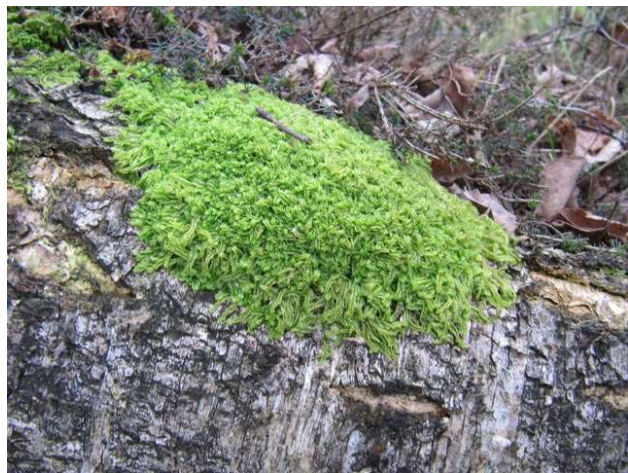
Southern Hemisphere Liverwort

March 2nd - Brain fungus - a brightly coloured feature of the winter scene: