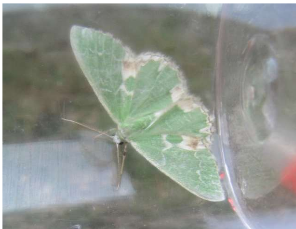
Blotched Emerald moth