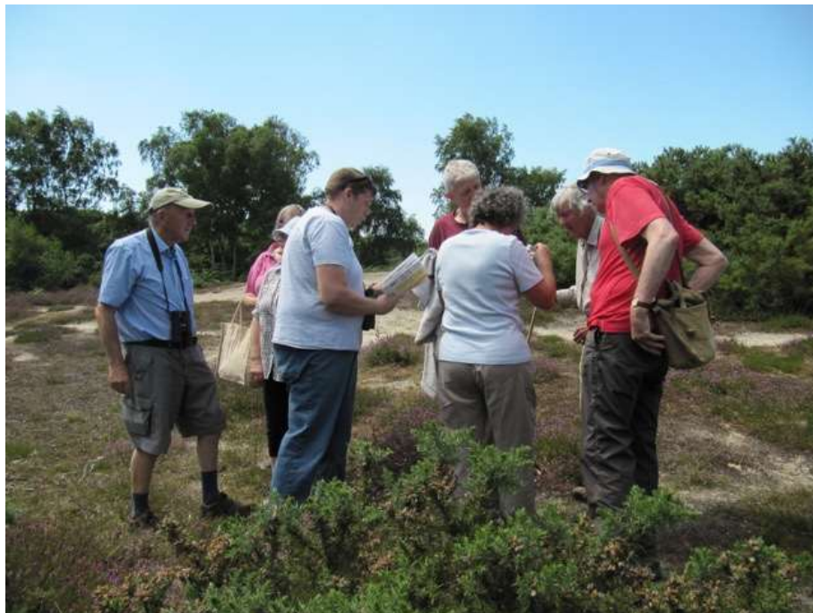
Serious study of a bee species

Plants in flower - Ragwort, Creeping Thistle, Yarrow, Black Moor grass, Scarlet Pimpernel, Sheep's Sorrel, Moth Mullein, Foxgloves, Toadflax, St John's Wort.