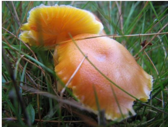
Wax Cap Fungus

More fungi were identified during the walk, and also on November 5th and 10th which are listed in the Appendix.