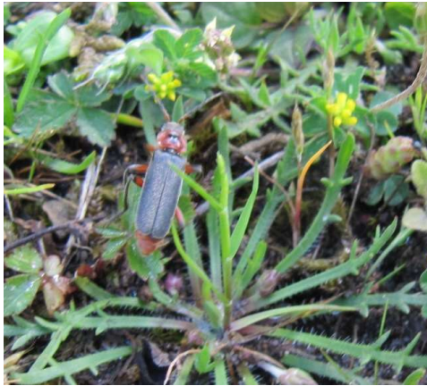
Soldier Beetle, Buckshorn Plantain Spotted Medick

(Also seen, the day before - Butterflies: Small Heath, Orange Tip and Comma.)